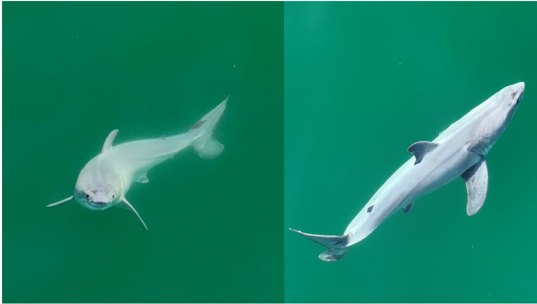
Fig. 1 Images of white shark with a white film covering its body observed 0.4 km off the coast of Carpinteria, CA, USA

(Fig. 2). Upon close examination of video and photos, the individual's pale color appears to be a thin white film covering the shark. We noted that as the shark was swimming, the whitish film was being sloughed off. During post-video analysis, we estimated the size of the individual to be 1.5 \pm 0.2 m TL, although with some uncertainty (Supplementary Information). We also wish to point out that, both days prior and the day of, large likely mature sharks were also recorded in the same area (Fig. 3). We propose two possibilities for this shark's interesting pale color: (1) the whitish film is left over intrauterine substances being sloughed off the shark due to it being a newborn shark, or (2) the whitish film is due to an unknown skin disorder that has not been reported in white sharks before in the published literature.