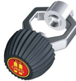
R-239 Yoke Adapter (Optional)