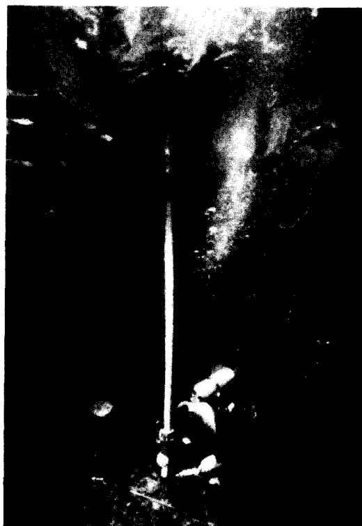
Figure 1. Airlift Sampler in operation.

the tube causes the mixture to overflow at the top and suction to develop at the bottom opening. Thus, the device can be used much like a vacuum cleaner, collecting organisms in a bag at the upper end (Figure 1).