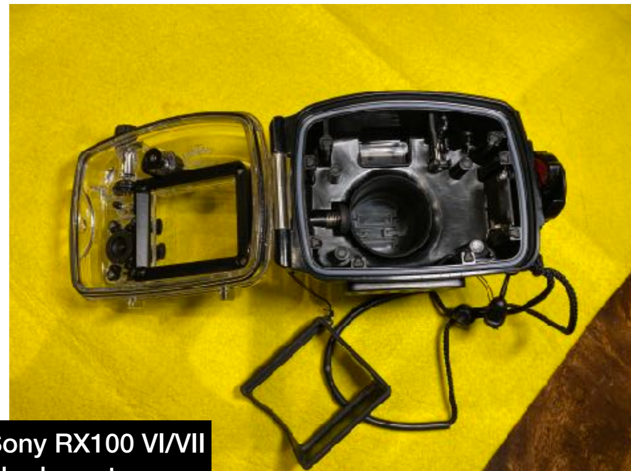
Fantasea housing for Sony RX100 VI/VII Used once, worked great