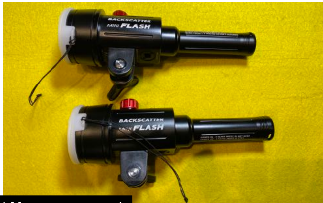
Backscatter Compact Macro, never used: 2 MF-1Strobe & 1 Optical Snoot