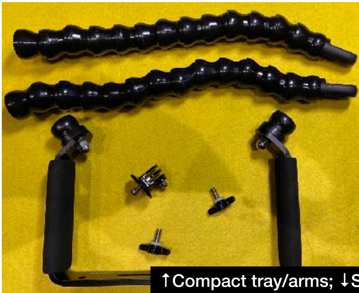
↑ Compact tray/arms; ↓ Sea&Sea fiber optic cables; → LiOn batteries/charger for MF-1s