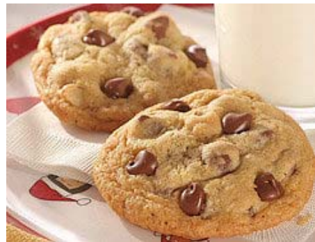
The chocolate chip cookies in an Ontario cottage proved too tempting for a hungry black bear.