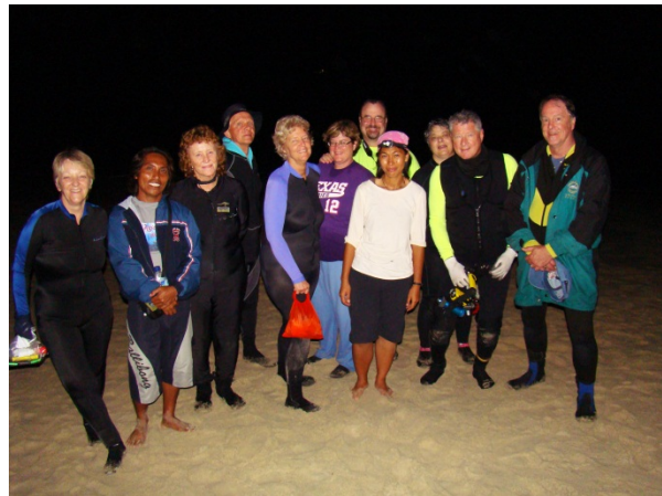
Expeditioners at Leatherback Beach