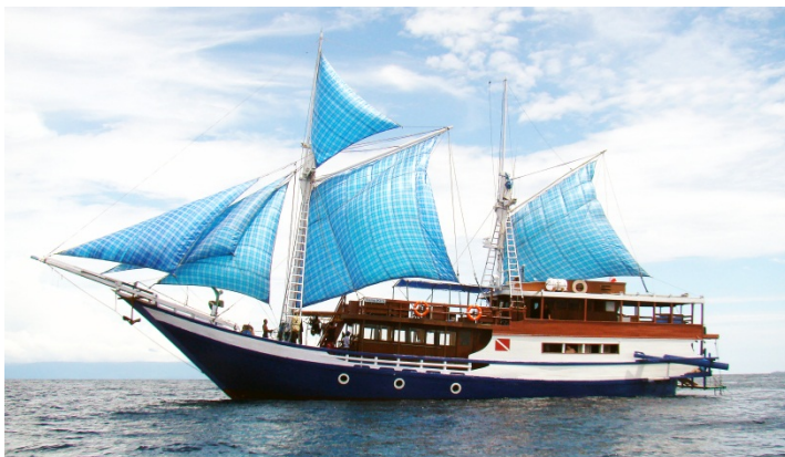
RAJA AMPAT EXPLORER - FLAGSHIP OF THE GRAND KOMODO DIVER FLEET